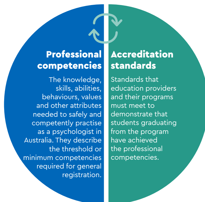
Figure 1: Relationship between professional competencies and accreditation standards

Professional competencies are typically referenced or embedded in the accreditation standards for approved programs of study and considered as part of the assessment of programs and providers. The competency requirements for a Board-approved qualification are detailed in the APAC Accreditation standards for psychology programs (the APAC standards). The accreditation standards require education providers to design and implement programs and curriculum that map to all the professional competencies for psychology (see Figure 1).