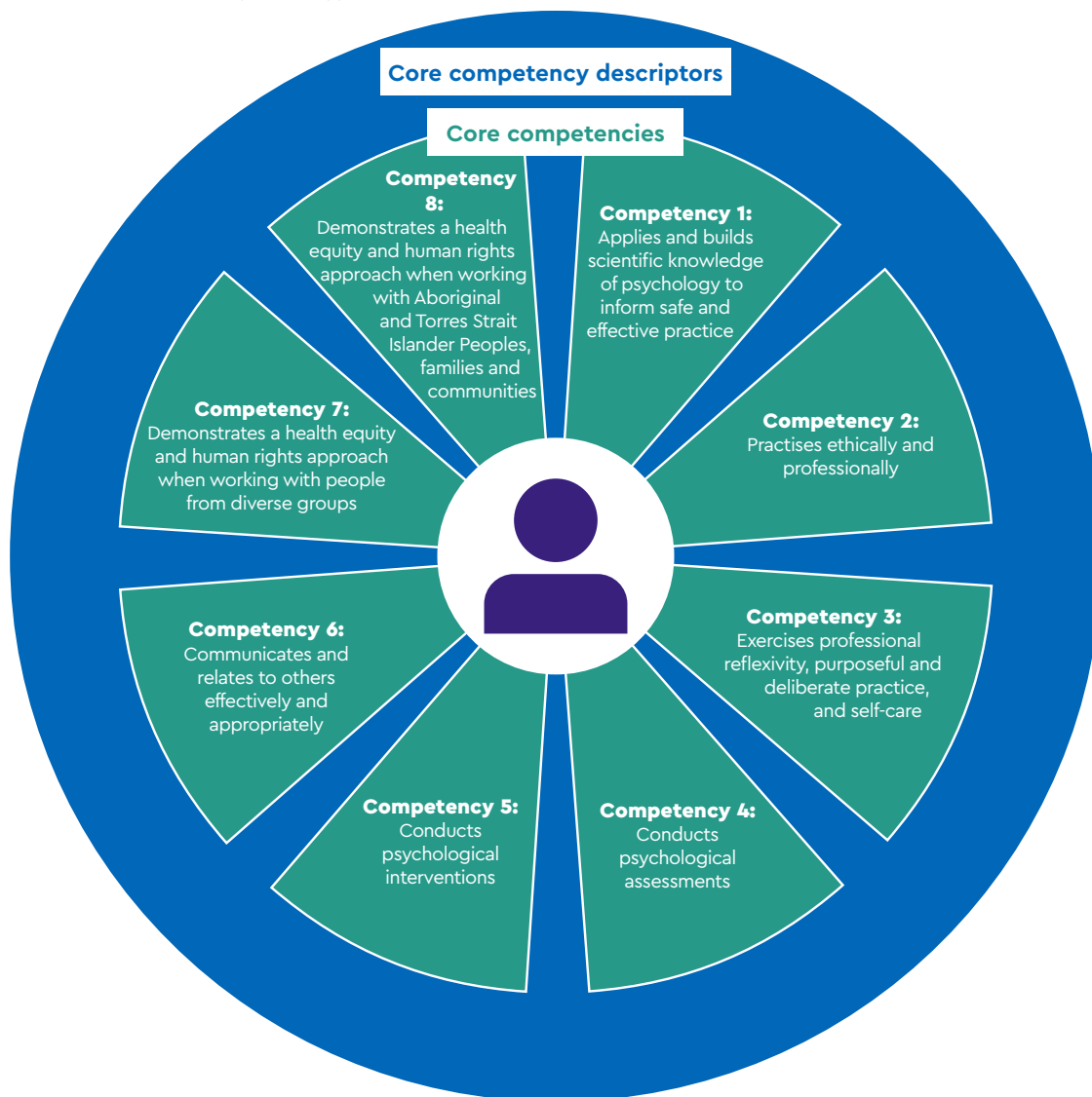
Figure 3: Safe and effective psychology practice