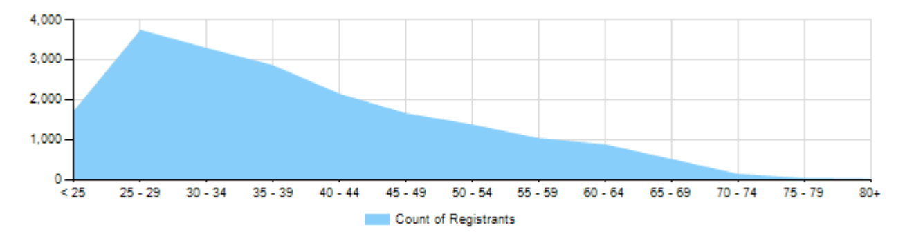
Table 2.4 Registration by age group