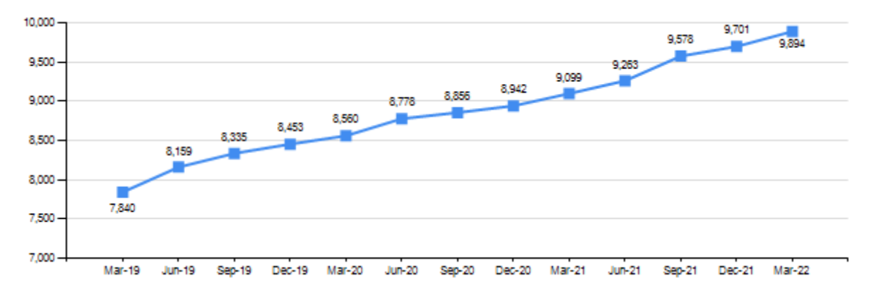
Table 4.2 Change in the number of approved supervisors