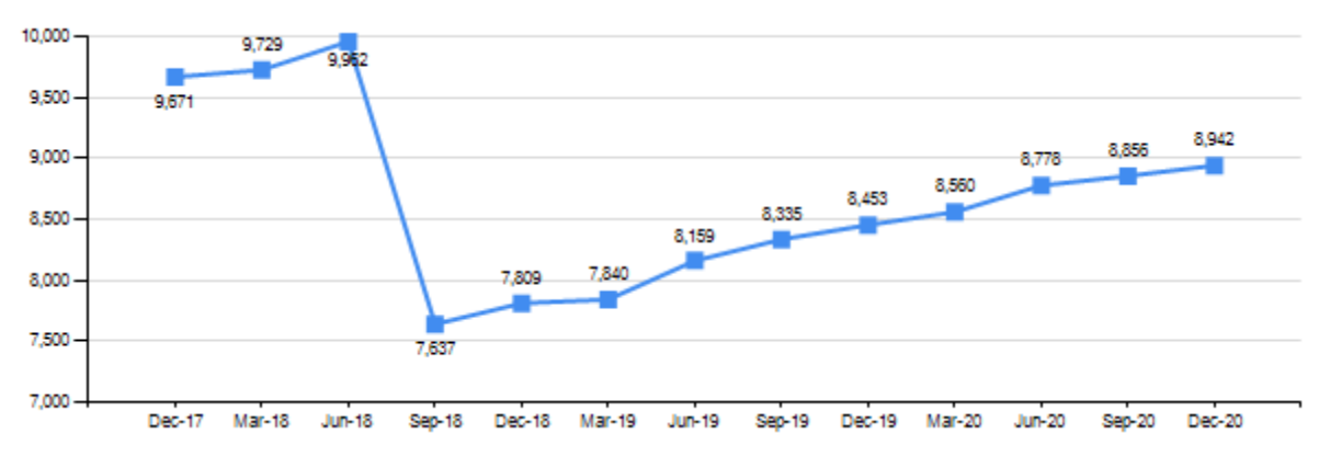
Table 4.2 Change in the number of approved supervisors

8,500 psychologists were approved, under transitional arrangements in 2013, to provide supervision until 30 June 2018. 2,900 did not renew their supervision approvals, accounting for the decline in total approved supervisors in September 2018.