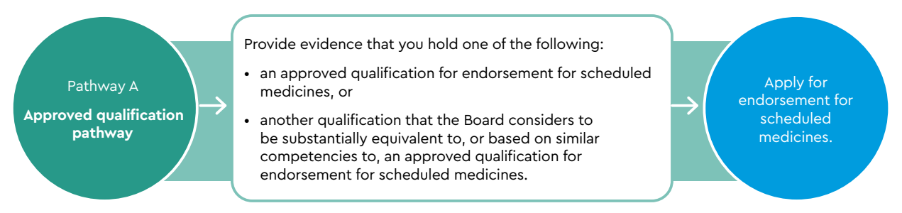
Figure 2: Pathway A to endorsement for scheduled medicines