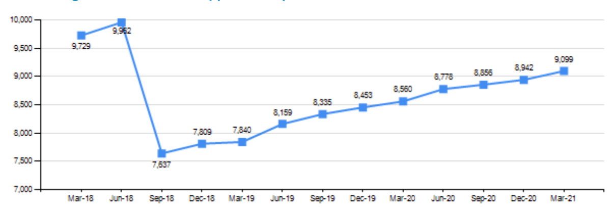
Table 4.2 Change in the number of approved supervisors

8,500 psychologists were approved, under transitional arrangements in 2013, to provide supervision until 30 June 2018. 2,900 did not renew their supervision approvals, accounting for the decline in total approved supervisors in September 2018.