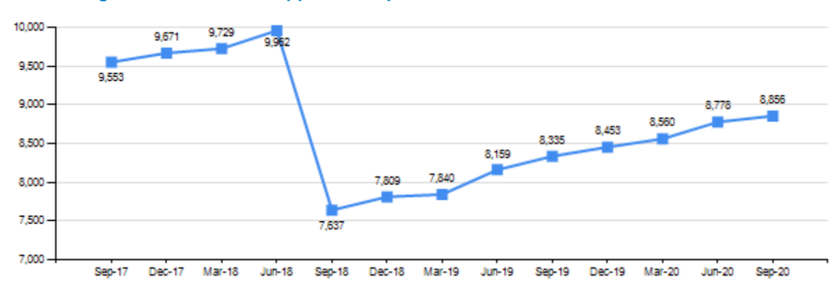
Table 4.2 Change in the number of approved supervisors

8,500 psychologists were approved, under transitional arrangements in 2013, to provide supervision until 30 June 2018. 2,900 did not renew their supervision approvals, accounting for the decline in total approved supervisors in September 2018.